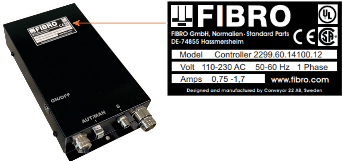
Fig. 3-3 Type plate

A type plate is attached to the control unit. The information on the type plate must be provided for all questions and orders.