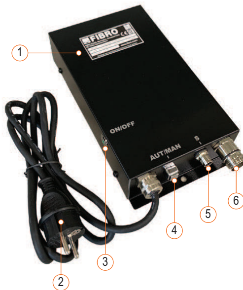
Fig. 3-1 Components of control unit BLACK LINE