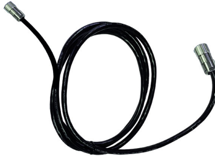
Fig. 3-4 Connection cable

The connection cable connects the control unit to an electrical transporter.