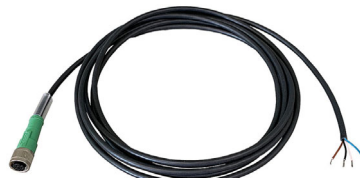
Fig. 3-5 Signal cable

The signal cable connects the control unit to an external device.