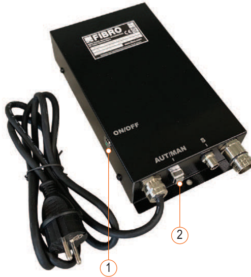
Fig. 6-1 Operating elements of control unit BLACK LINE